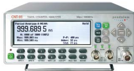
Figure 4: Display showing different statistical parameters viewed at the same time.