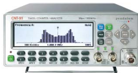
Figure 6: The same result as in Figure 5, now displayed as a histogram.