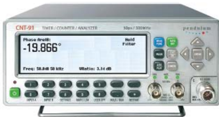
Figure 1: Display showing phase value, frequency, attenuation Va/Vb, and auxiliary parameters.