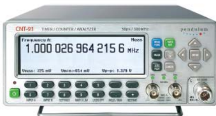
Figure 3: Input parameter setting menu shown with measured result.