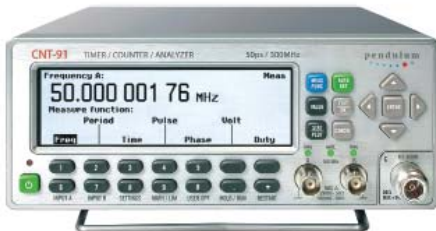
Figure 2: Measure function selection menu, shown with measured results.